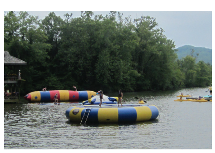
Many floating activities (blobs, icebergs, water trampolines, etc.) have blind spots that necessitate additional lifeguards for full zone supervision. Markel recommends strongly that all participants wear U.S. Coast Guard-approved life jackets.

All pools and lake swimming areas should have a safety-float rope separating the deep end from the shallow area. State regulations vary on the water depth, but most regulations fall around 4 feet 6 inches. There is no magic depth that is safe for swimmers. Lifeguards should be aware that many drowning incidents occur in water 4 to 6 feet deep—the child bounces on his toes with his nose in the air, and the lifeguard fails to recognize that the child is in danger. A key indicator that lifeguards should always watch for is a swimmer's ability to make forward progress in the water.