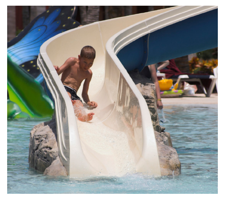
This slide exit is almost too vertical. A participant coming down head first could hit the concrete bottom.